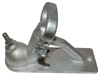
50mm Snap On 3 Hole Coupling - Galvanised Finish Part No. 950-164ZP