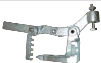
Master Cylinder Bracket - Galvanised Finish Part No. 950-041ZP