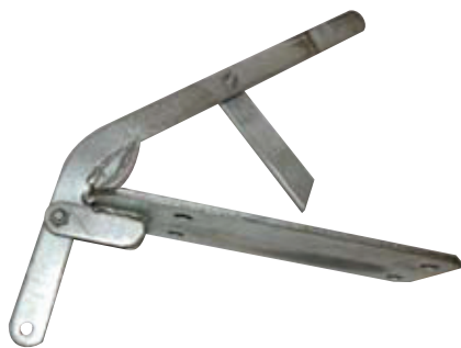
Hand Brake Lever - Suit Mechanical Override Coupling Galvanised Finish Part No. 959-050ZP