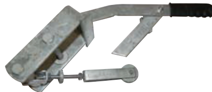
75mm Override Hand Brake Lever - Galvanised Finish Part No. 950-040