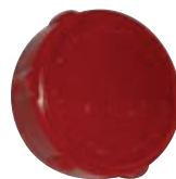
Hydraulic Master Cylinder Cap 3/4" Dia Part No. 950-046