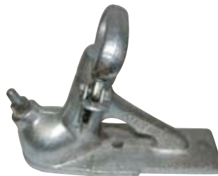
50mm Snap On 2 Hole Coupling - Galvanised Finish Part No. 950-163ZP