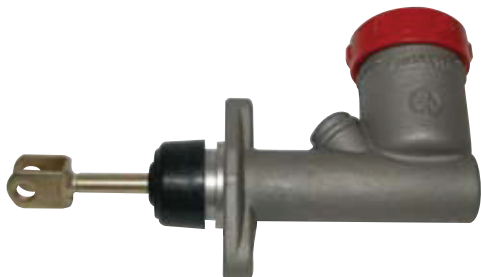
Hydraulic Master Cylinder 3/4" Dia - Part No. 950-029