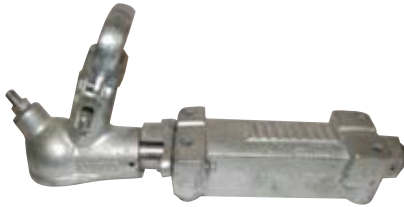
50mm Snap Mechanical Override Coupling Galvanised Finish