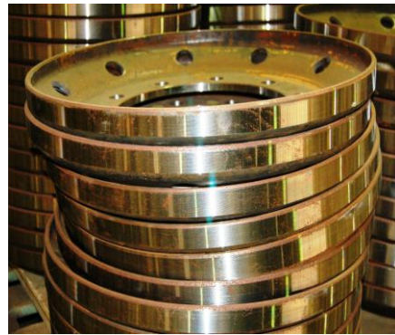
Formed / Shaped Centre Disc

After the appropriate centre disc is fitted to the 5-piece rim the bolt holes are then drilled and the centre bore diameter is machined to specification, so the wheel can be fitted onto a specific vehicle.