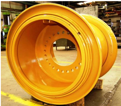
Flat Plate Centre Disc Fitted

5-piece Earthmover wheels are typically fitted with either a flat plate centre disc or a formed (or shaped) centre disc. The two types of centre disc are shown below.